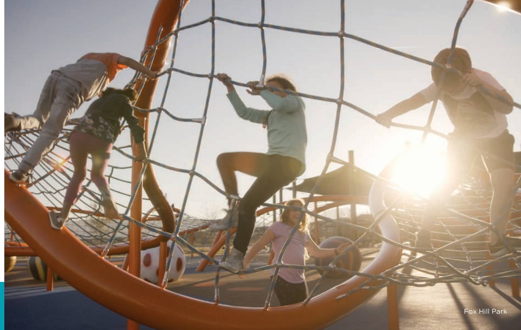
Fox Hill Park

Summerlin's community parks boast swimming pools, tot lots, baseball fields, basketball courts, ziplines, Frisbee golf and pickleball courts. The Summerlin Library & Performing Arts Center and the Nevada Ballet Theatre bring dance, drama, music, comedy and culture. Here, lifelong play isn't just encouraged. It's mandatory.