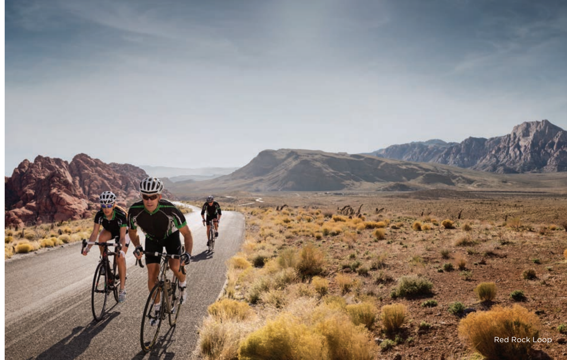
Red Rock Loop

This is life lived out loud. Outside the box. Outside the lines, defined only by the outstanding backdrop of stunning Red Rock Canyon. With 300+ days of constant sunshine each year, life in Summerlin is as bold, beautiful and brilliant as it gets.