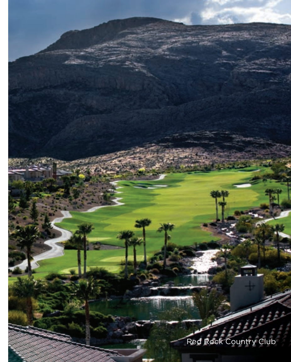
Red Rock Country Club